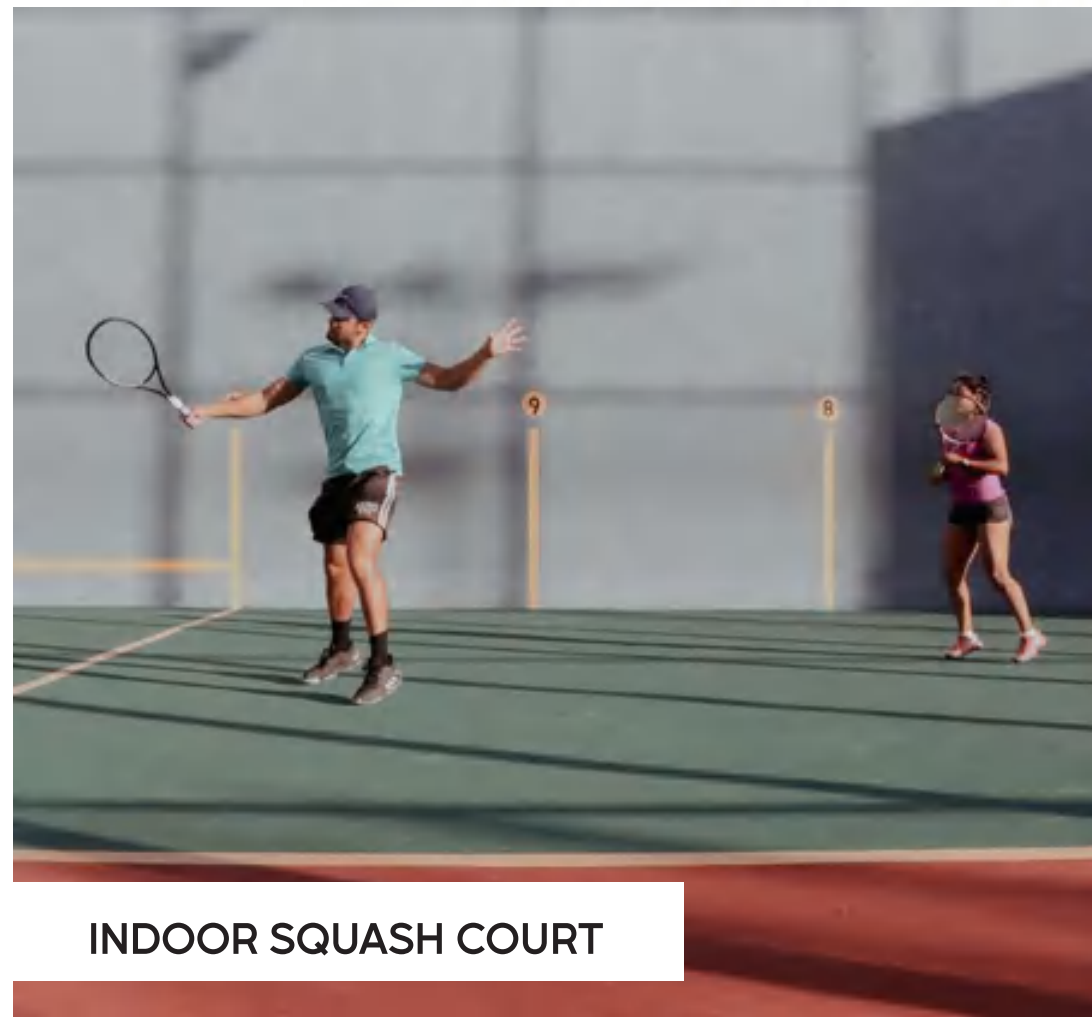
INDOOR SQUASH COURT