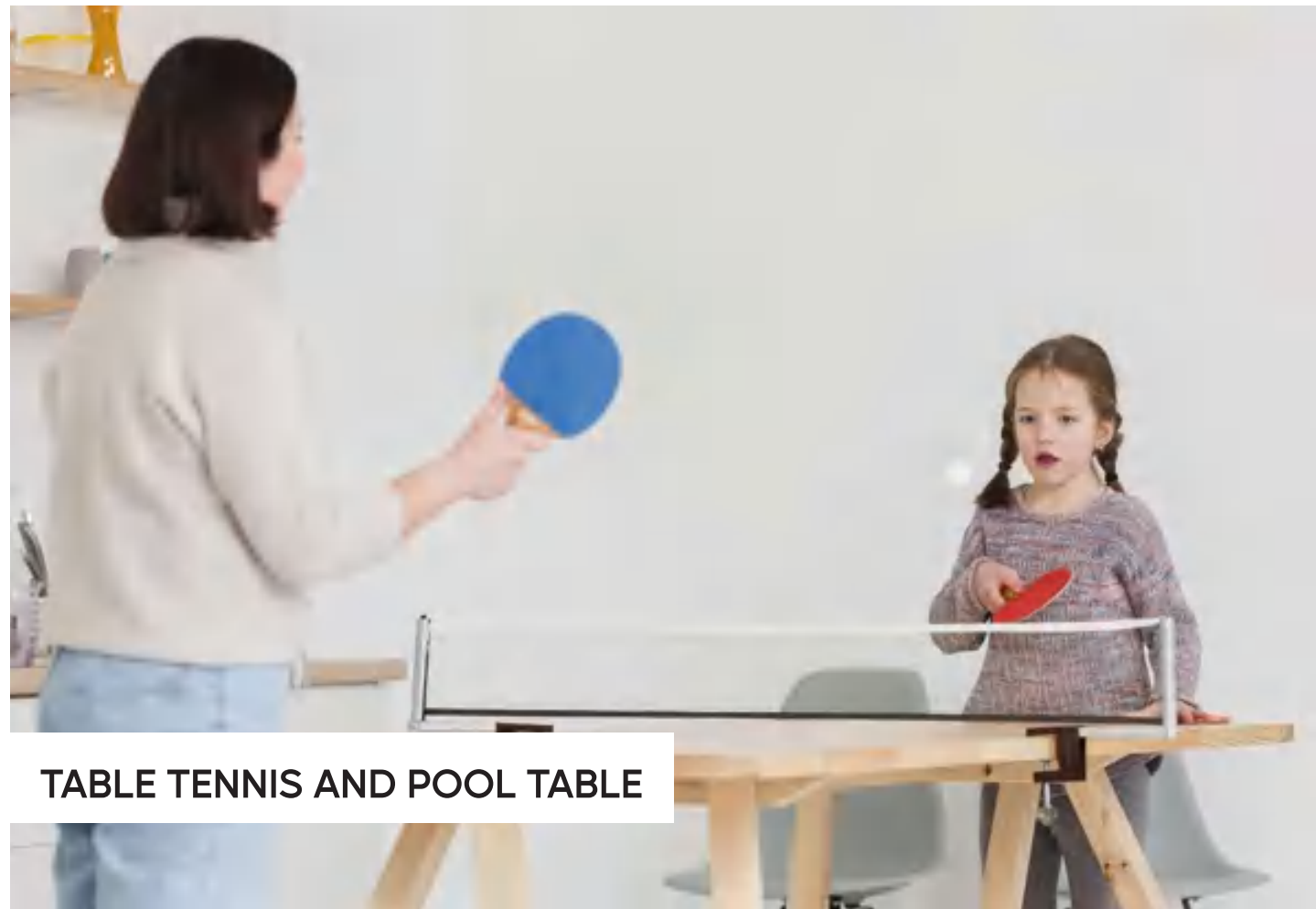
TABLE TENNIS AND POOL TABLE