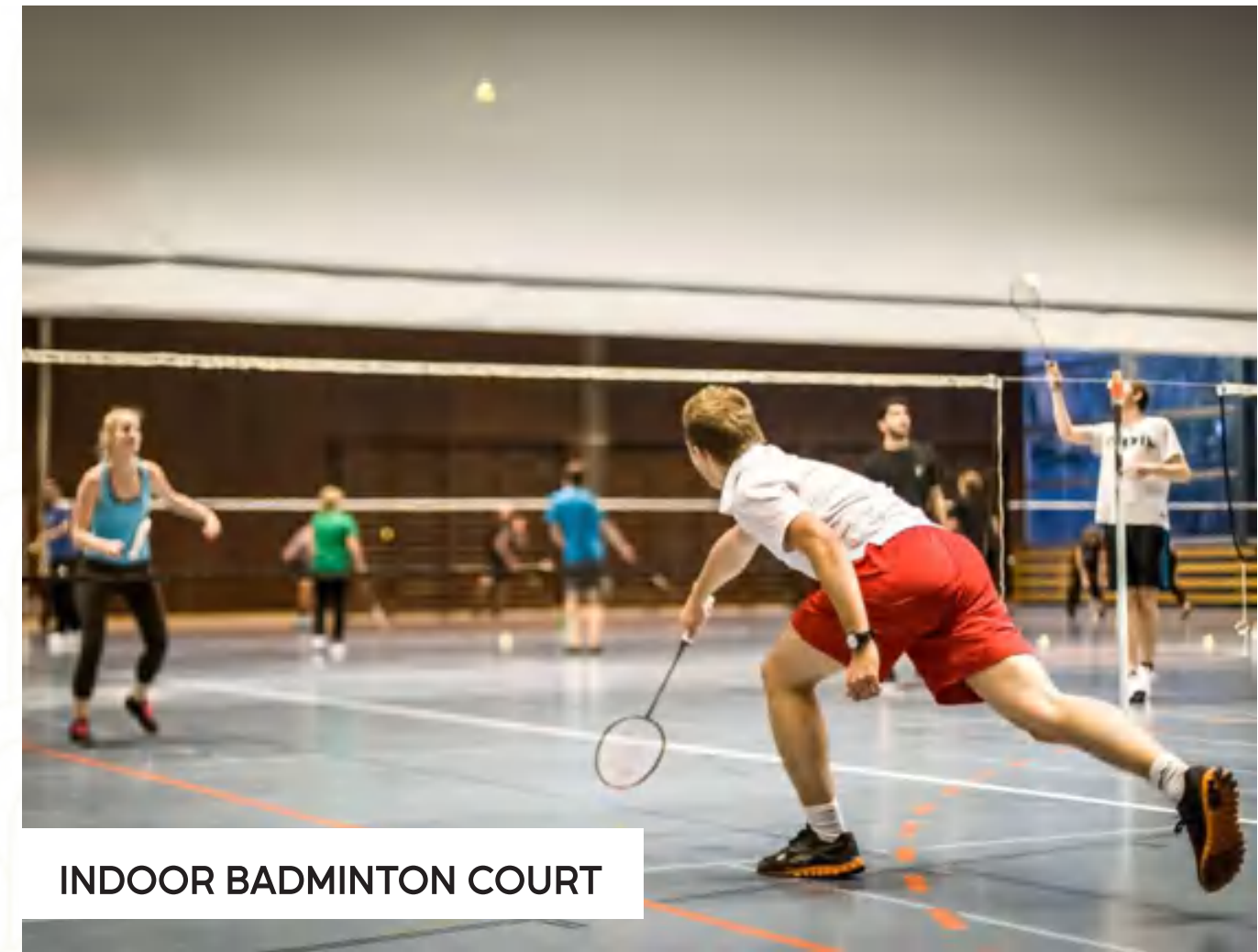
INDOOR BADMINTON COURT