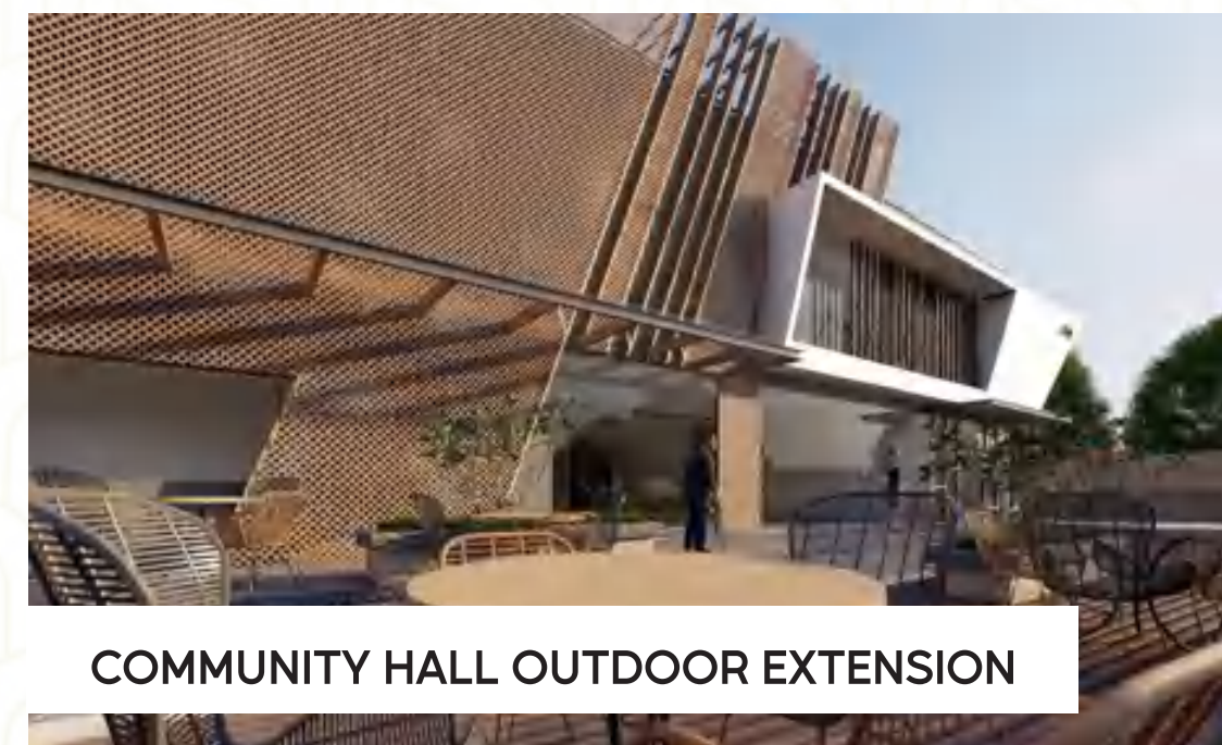
COMMUNITY HALL OUTDOOR EXTENSION